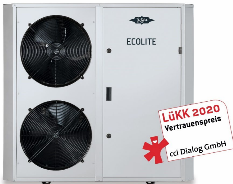
Image 1: BITZER ECOLITE will soon be available for A2L refrigerants; earlier this year, BITZER condensing units took first place in the German 2020 HVACR trust award

Images may only be used for editorial purposes. This usage is free of charge if 'Photo: BITZER' – and a free copy of the publication is sent to us. Images may not be modified or altered, except to crop out the background surrounding the main subject.