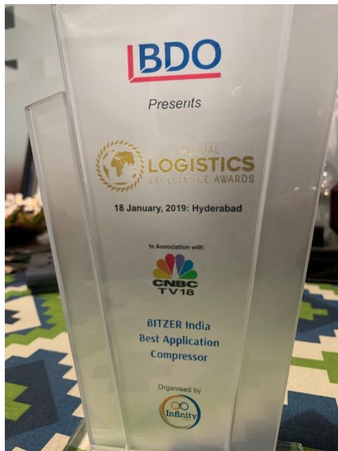
Image 1: BITZER India won the Best Application Compressor award for the CSVH series

Images may only be used for editorial purposes. They can be used free of charge if the source is given – 'Photo: BITZER' – and a free copy of the publication is sent to us. Images may not be modified or altered, except to crop out the background surrounding the main subject.