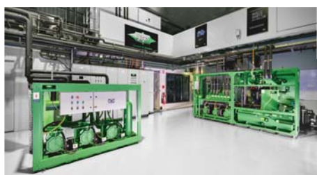
CO 2 Transcritical compressor system custom engineered in Australia for Woolworths